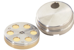
Crystal Retainer Assembly and Standard Stainless Steel Cover