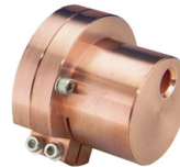
Copper Head Cover