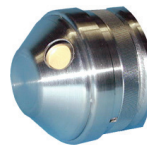
45° Angle Head